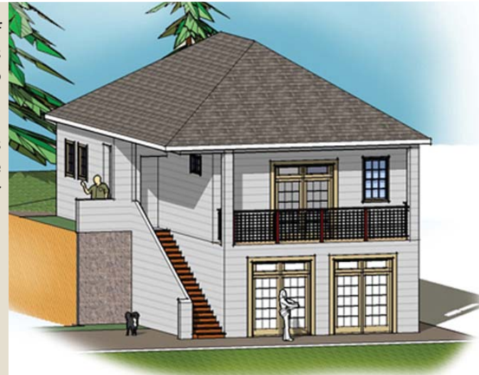
Artist's Illustration of a Typical Live/Work Home on Woodbridge Road